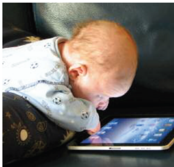
Babies, children and pregnant women are particularly vulnerable to EMF emissions from electronic devices.