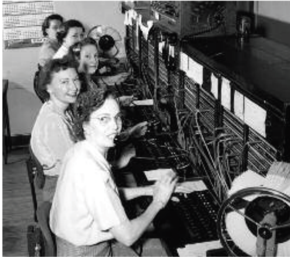
Telephone switchboard operators working in 1952.

claim dominance and spread around the world.