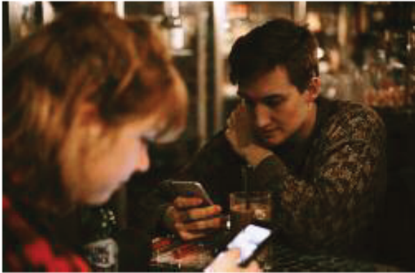
We are drowning in a sea of electromagnetic radiation.

thermal effects do not account for non-thermal (athermal) biological effects—the cumulative effects of constant exposure to multiple EMF sources all day and all night.