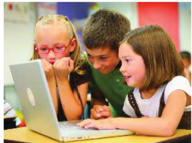
Children's exposure to computers and wireless technologies should be kept to a minimum.

Stetzer explains that at 1.7 kHz all this electromagnetic energy dissipates internally in the body and the electrons are excited and start to oscillate at the same rate. This is one reason why the Russians have different guidelines that change at 2 kHz. 105 Most laptops and computers generate 12.5–50 kHz, while printers, photocopiers, PlayStations and most electronic equipment generate 10–100 kHz. The non-ionising frequency range extends from Hz to kHz to MHz to GHz to THz.