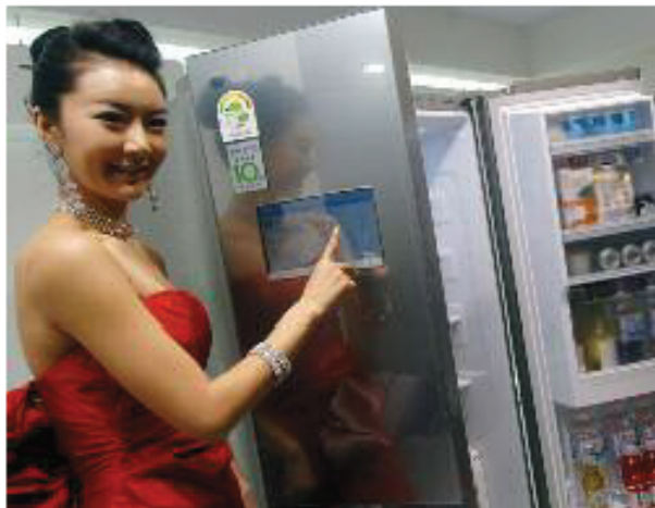
LG Electronics launched its first appliances embracing "smart grid-ready" technologies on 19 April 2011 in Seoul, South Korea.

Instrumental in giving us the ability to use our sophisticated technologies today, Nikola Tesla also unknowingly gave us a solution. Tesla warned against the use of X-rays and also pondered what effects the generation of electricity would have on humans. In 1899 he discovered scalar energy, which he termed "radiant