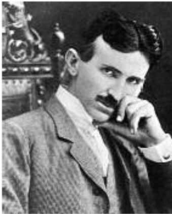
Nikola Tesla (1856–1943), photographed c. 1896.

Lessening exposure to EMF is vital for our wellbeing today but also for future generations, as EMF is known to enhance the damage from other toxic agents. 122