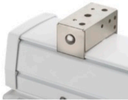
(ceiling, wall, suspended)